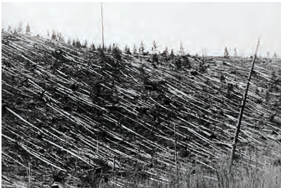
Tunguska Explosion - 45 Years Later

The laws of physics demonstrate that when one object collides with another object, energy is released. The amount of energy released is related to the size, speed, density, and direction of the impact. When it comes to cosmic collisions (such as an asteroid impacting Earth), an additional factor is added into the equation because of Earth's atmosphere. When a meteor plunges toward Earth at speeds between 30,000 and 75,000 miles per hour, the leading surface of the asteroid experiences an increasing level of atmospheric pressure as it gets closer to Earth's surface because our atmosphere has higher density at ground level. This atmospheric pressure is much like the